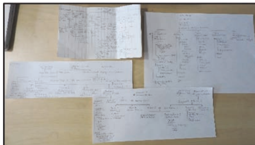
Some of the Ehrenberg family papers

I did some research in preparation for cooperation with the Leo Baeck Institute in New York. They also hold material relating to the Ehrenberg family