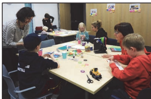
An impression of the 12th May Day Diary event.

which they have digitised. I checked their digital archive (DigiBaeck), to see if what they hold is also in the Ehrenberg/Elton Papers collection at The Keep, so it can be linked into the catalogue.