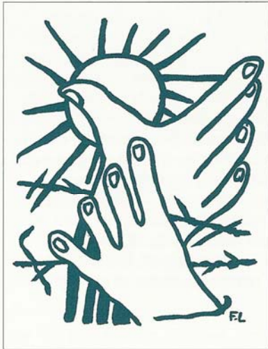
Fernand Léger, Untitled , 1955 From La Déportation