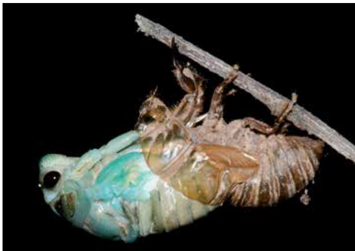
The striking blue color of this emerging lyric cicada ( Neotibicen lyricen) will fade as its body hardens and turns darker.