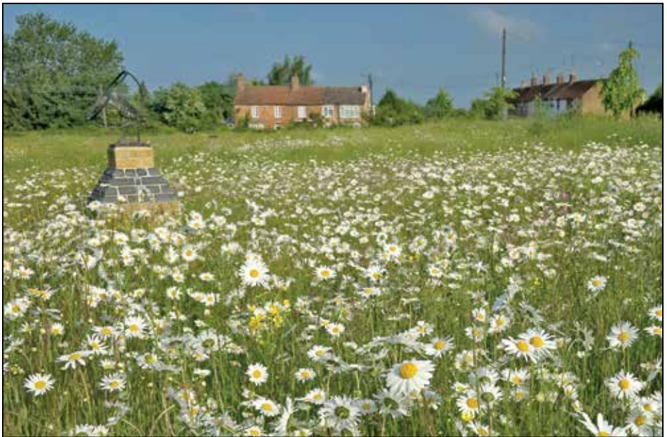
Britain's village greens, which often have flower-rich meadows sheltered from pesticides, can provide valuable habitat for wildlife.

This article is adapted from a post on Goulson's blog, http://splash.sussex.ac.uk/blog/for/dg229 .