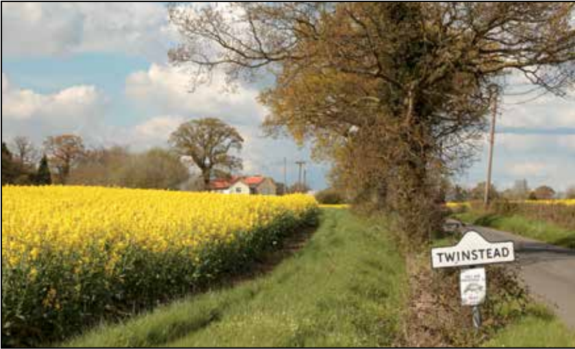
Trees and hedgerows are an essential feature of Britain's countryside, supporting a wide range of plants and animals. Pesticide use in surrounding fields has a negative impact on wildlife.

solitary bees; in Britain, honey bees contribute no more than perhaps 30 percent of crop pollination, the rest coming from wild insects.