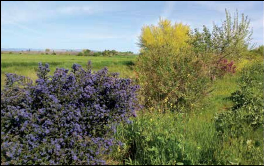
Several years after planting, this hedgerow provides insects with shelter for nesting and season-long bloom for foraging.

bees, these mature habitat areas support less-common bee species. This work shows that we can increase biodiversity in the landscape through specific restoration projects.