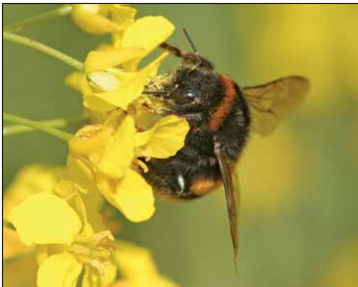
There is little doubt that neonicotinoid use is harming bumble bees. When exposed to treated crops, their colonies grow slowly and produce fewer queens.

should probably be viewed with a bit of skepticism. Even if we take such studies at face value, they do not rule out the possibility that exposure to neonics might contribute to colony loss in the longer term—for example, by reducing queen longevity, or fecundity, or both—but it does seem that there is no dramatic and immediate effect on honey bee colonies in the way that there is on bumble bees and solitary bees.