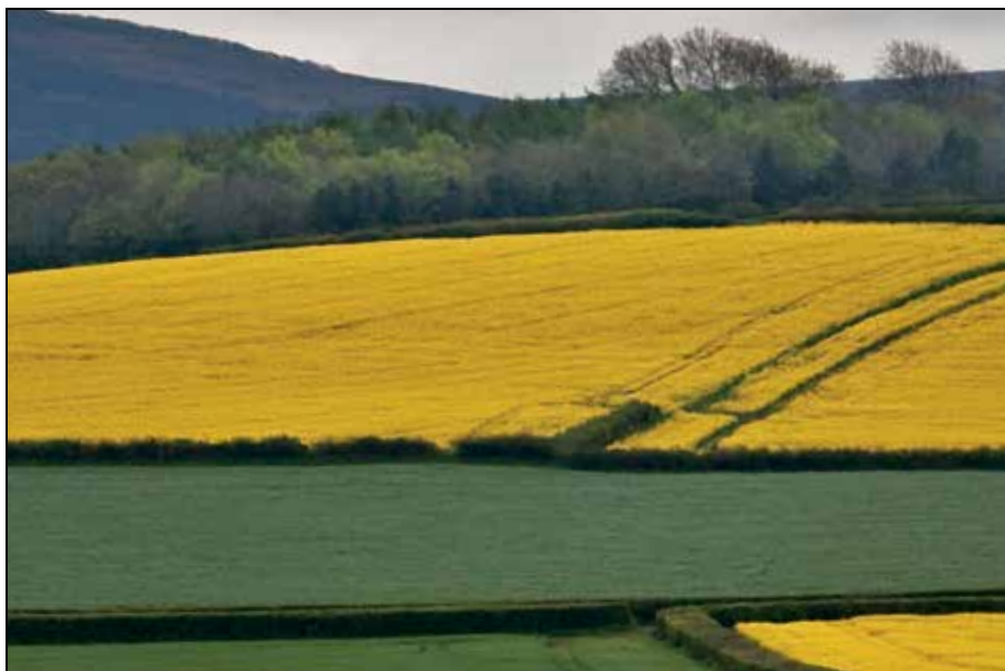
Oilseed rape has long been a point of contention in rural England, its bright color disrupting the bucolic landscape. It is once again at the center of a debate, this time over the impacts of insecticide use on bees.

The researcher’s comments can be paraphrased as: “It is all complicated and confusing, and we can’t really be sure what harms bees. The moratorium on neonicotinoid use on flowering crops