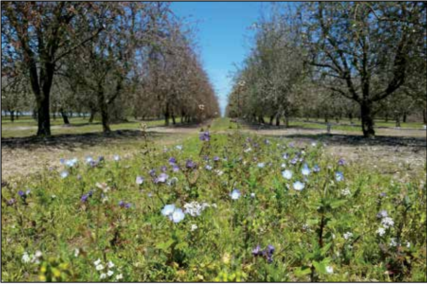
Conservation-minded growers can make a difference by providing habitat. This almond orchard in the Central Valley is being managed to support bees and other beneficial insects.

tor stewardship. We are also rolling out a bee-specific product-rating program this summer. Bee Better Certified will allow farmers and the companies that buy their produce to label their products as Bee Better if they meet requisite standards for habitat management and pesticide stewardship.