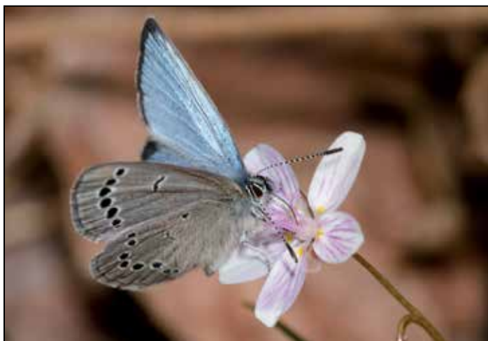
Male silvery blue ( Glaucopsyche lygdamus) nectaring on spring beauty ( Claytonia virginica)