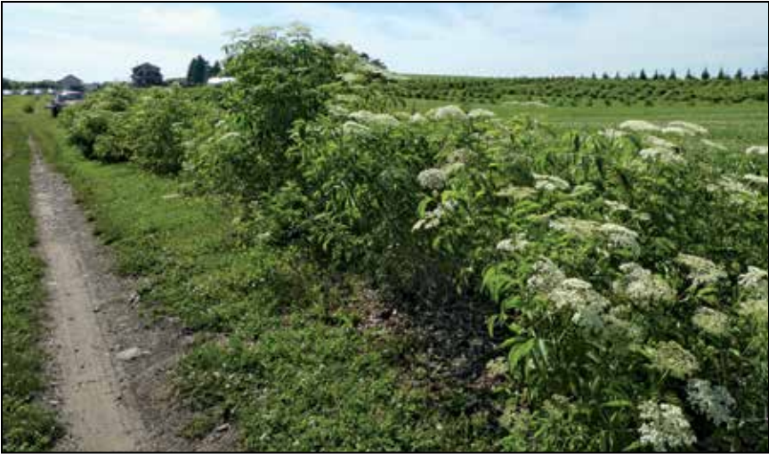
The shrubs in this hedgerow support insects and provide a range of edible fruits. Those include currant and juneberry, though the white flower heads of elderberry are most obvious.

early spring; the blueberry blossoms offered resources in late spring; and after that there was almost no food available other than a few stray goldenrod and milkweed plants in a weedy margin mostly dominated by invasive grasses. To address this deficiency, we planted five “insectary strips” running the length of the farm and evenly spaced across the fields, composed of more than fifty different kinds of native wildflowers and grasses. Now flowering, these strips provide a diverse, season-long food source for bees, while also giving the farm a more wild feel, adding beauty and interest to the U-pick experience. In addition, the habitat helps to hold soil, water, and snow in place, preventing erosion and resulting in more snow deposition on the blueberry plants for much-needed winter insulation.