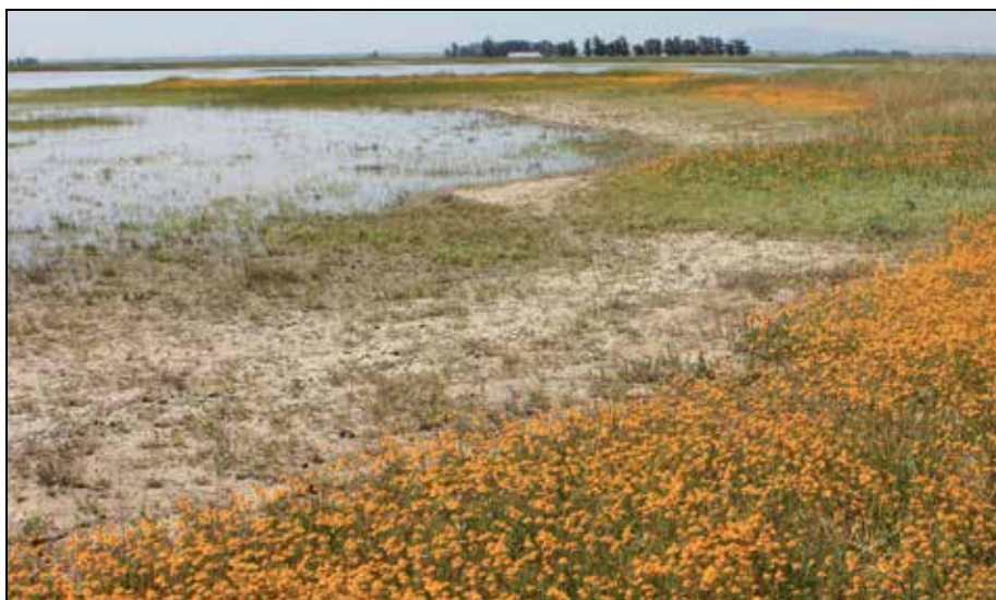
The Central Valley's few remaining vernal pools hint at the landscape that John Muir experienced in the late nineteenth century. In spring, the seasonally drying pools are surrounded by goldfields ( Lasthenia), a member of the aster family, the Compositae noted by Muir.

Since its inception, our pollinator program's work with farmers and the Natural Resources Conservation Service has led to the establishment of more than 420,000 acres of wildflower-rich pollinator habitat across the United States. This includes miles of hedgerows planted in the Central Valley in cooperation with farmers and other partners; hedgerows planted a decade ago have now developed into mature habitats that provide homes for bees, butterflies, birds, and other animals. Recent studies also show that in addition to generalist