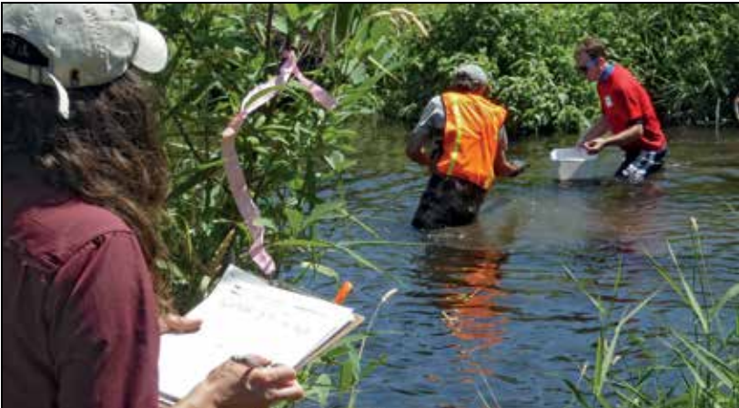
From the day it was founded in 1971, the Xerces Society has built its conservation efforts on a firm foundation of knowledge and scientific evidence. Here, staff and volunteers are gathering data on a population of freshwater mussels.

We harness the power of thousands of people throughout North America to gather valuable conservation data. Through Bumble Bee Watch, individuals from all walks of life help identify