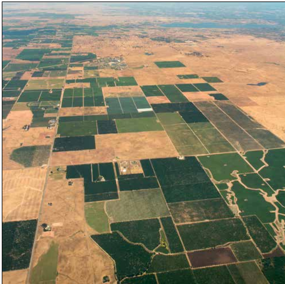
Seen from the air, the scale of the Central Valley landscape's transformation is readily apparent. Crops push right to the Valley's edges, leaving little room for wildlife.

will necessarily be restricted to the field edges, roadsides, and ditch banks, but hedgerows and flowering strips and meadows in these areas will increase the diversity and abundance of pollinators as well as of the predators and parasites of crop pests. Maximizing restoration and management of such linear habitat opportunities will be vital if we want to restore large areas of the Valley.