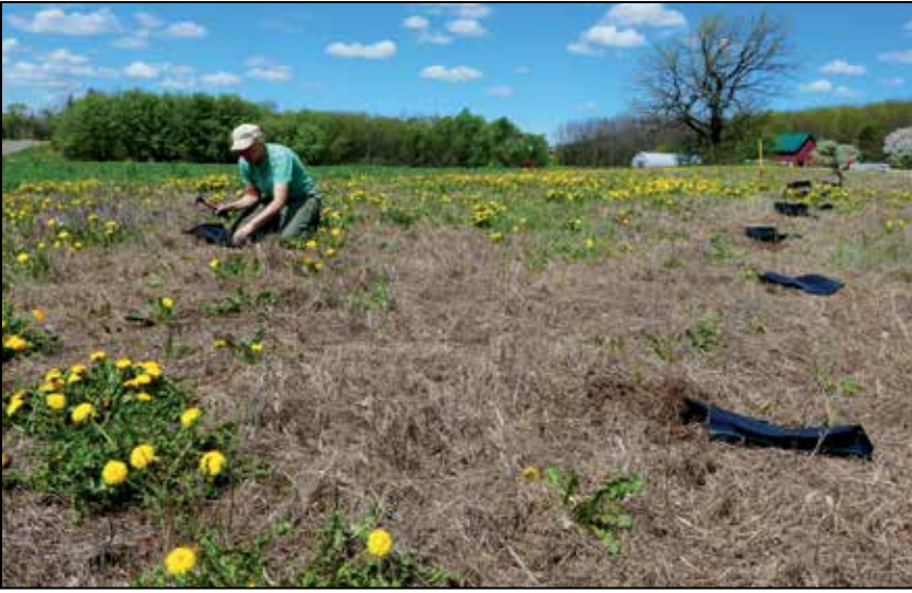
For many farmers, their personal connection to the land both inspires them to improve it for the next generation and justifies all the hard work that doing so entails.

grated directly into the brassica fields aren't helping, especially after seeing these flowers covered in wasps, lightning bugs, and lady beetles during my summer visits.