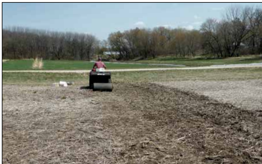
Xerces staff members work with farmers to develop successful organic techniques for the weed control and seedbed preparation necessary to establish wildflower habitat.

In 2014, when I first visited Little Hill Berry Farm, we took some time to evaluate the existing habitat at the farm from the perspective of a pollinator. We found that although there were high-quality nesting areas for bees, food resources were often scarce during the entire length of the growing season. A few deciduous trees provided forage in