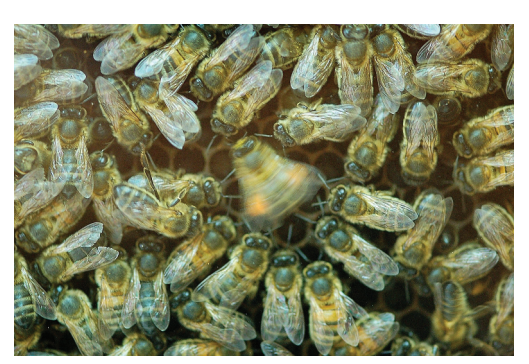
A honey bee pollen forager making a waggle dance back in the hive.

One main way that LASI has been researching honey bee foraging is by 'listening' to the bees. That is, by decoding their waggle dances. Waggle dances are made by workers foraging at high quality flower patches. The dance communicates the direction and distance of the flower patch to the dancer's nestmates. We first video the dances using observation hives. We then decode the dances by playing them back frame by frame on a computer to measure the waggle run angle, which gives the direction of the flower patch from the hive, and duration, which gives distance. We can then map the dances to determine where the bees are foraging and the distances they travel.