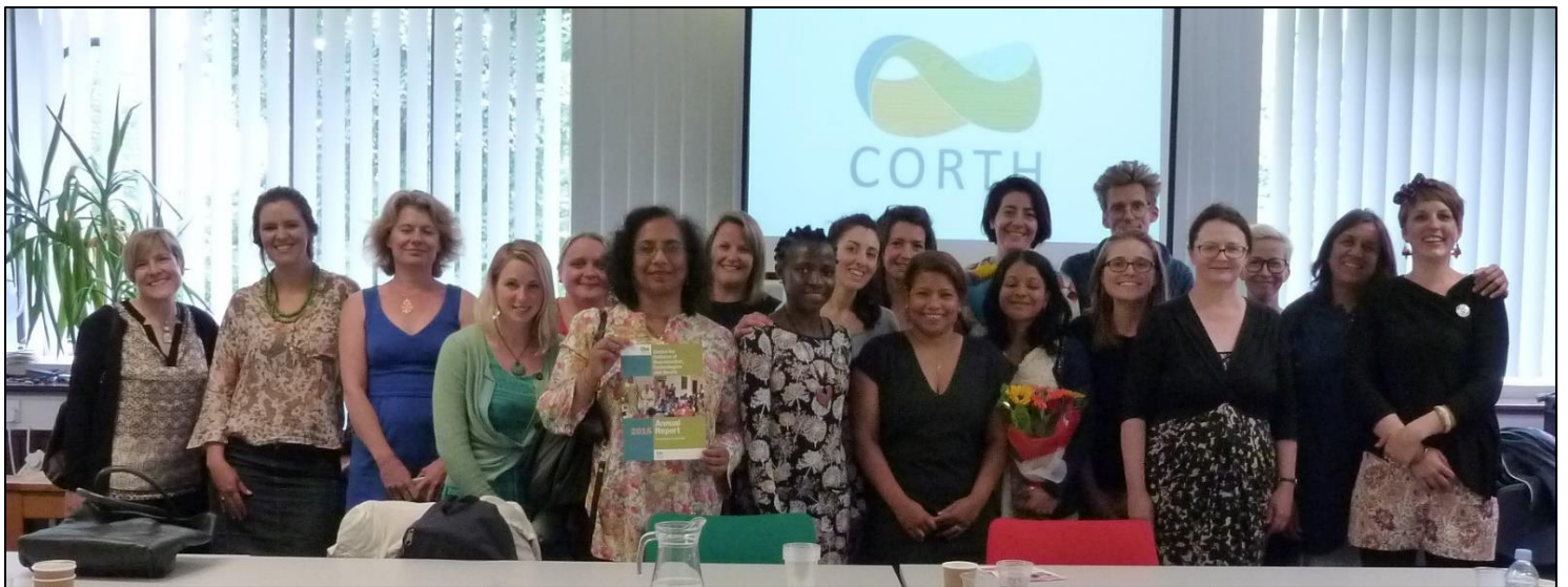
The CORTH group