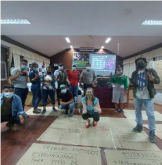
Students at a project workshop: UNIA