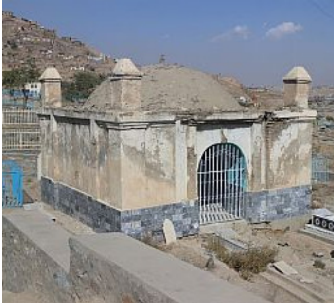
Tomb of the last Emir of Bukara, from Magnus's new project