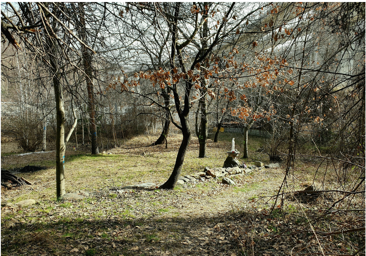
'La Maddalena, Chiomonte Italy'